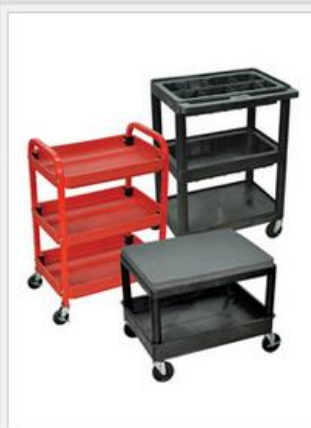
Mechanics Cart and Seat