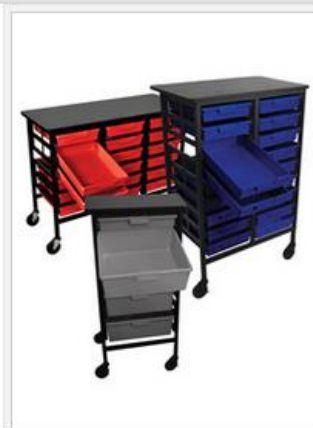
Bin System Carts