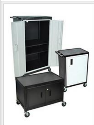
Enclosed Cabinet Carts