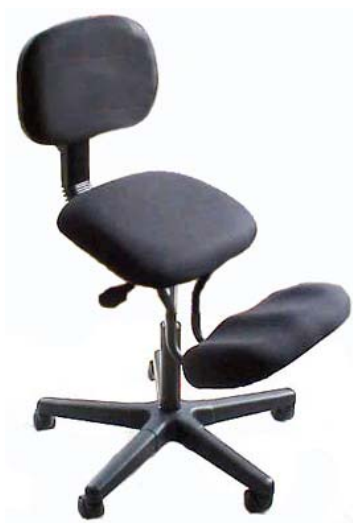
'Backsaver' Kneeling Chair with Backrest

In recognition of the problems with the original Balans design a number of companies now offer a version with a backrest. The 'Backsaver' shown below is one example: -