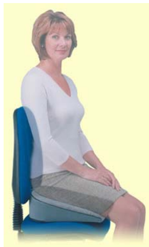
Wedge seat cushion