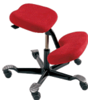
The Hag-Balans chair

In this design the seat base is lower at the front than at the back and a knee pad is provided to prevent the sitter from sliding off the seat