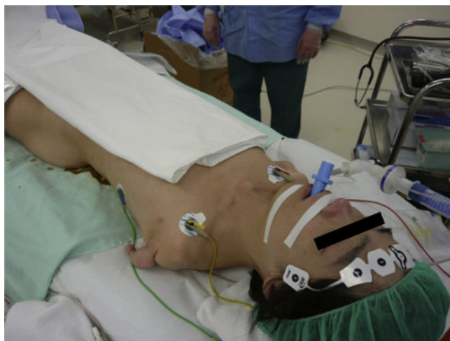
Fig. 2. The patient had upper-limb defects, and the vital signs and other systemic parameters were monitored by electrocardiography, non-invasive sphygmomanometry, invasive arterial pressure measurements, pulse oximetry and neuromuscular block monitoring throughout the procedure.

After induction of anaesthesia using propofol (60 mg), fentanyl (0.1 mg), and rocuronium (20 mg), tracheal intubation was performed. The intubation was relatively easy, and the Cormack–Lehane grade was 1. During anaesthesia induction, the